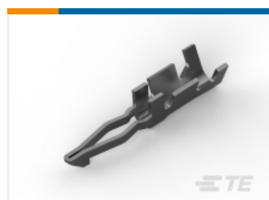
TE Part # 172781-2 MINI AMP IN