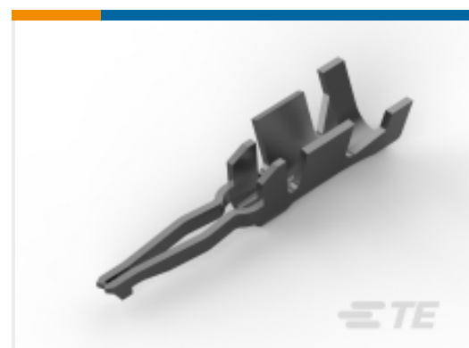
TE Part # 172782-5 LOW PROFILE MINI AMP-IN