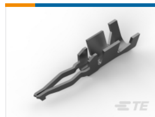
TE Part # 172782-7 LOW PROFILE MINI AMP-IN